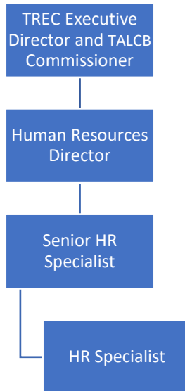
Exhibit 3: Texas Real Estate Commission Human Resources Organization Structure.